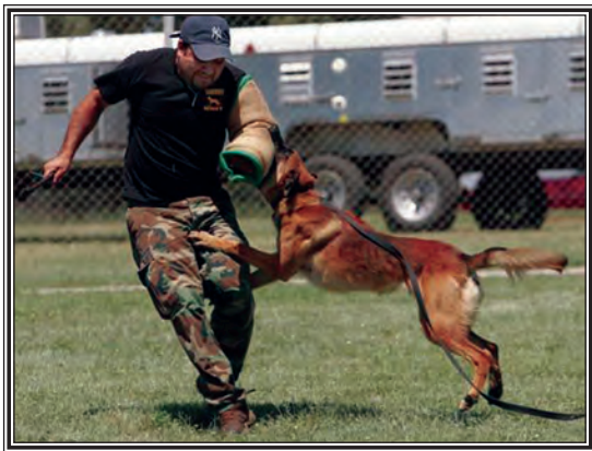
Figure 3: MWD bite training.

Medics should also be versed in medical evacuation procedures for dogs. For example, they should know veterinary facility locations in theater for evacuation, and they must understand that when the dog is injured and evacuated, the handler must accompany the dog, and will thus be temporarily taken out of the fight.