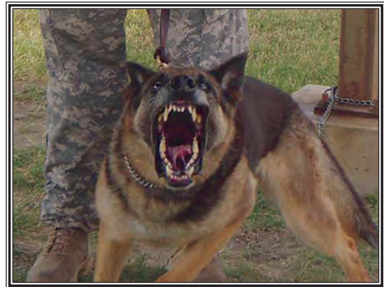
Figure 4: MWD aggression.

The use of working dogs entails some risks. Their aggressive disposition and attack training occasionally result in inappropriate bites. (Figure 3) Extreme caution is needed when handling injured MWDs because fear, pain, and stress can greatly increase the risk of a bite. (Figure 4) Ensure handlers properly restrain and muzzle dogs for all medical procedures or any other time there is an increased risk of indiscriminant biting.