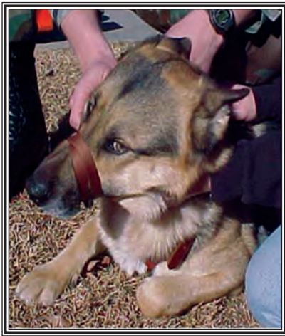
Figure 5: A field expedient muzzle made using the dog's leash.

creased risk of infection. If vital structures are injured, a surgeon should be consulted. The dog handler should examine the MWD's mouth for missing or broken teeth which may be left in the wound.