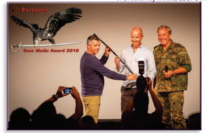
CMC 2018 European best medic award

All articles published in the Journal of Special Operations Medicine are protected by United States copyright law and may not be reproduced, distributed, transmitted, displayed, or otherwise published without the prior written permission of Breakaway Media, LLC. Contact publisher@breakawaymedia.org.