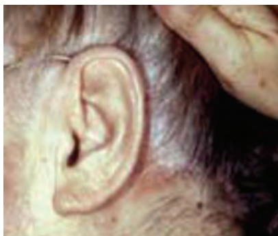
Photo # 4

The most common presentation is chronic plaque-type psoriasis with chronic well-defined plaques usually found on the extensor surfaces. The guttate variant demonstrated in photos one and two represents the most common presentation in a patient before age 20. The distribution is diffuse and primarily affects the trunk and extremities. Lesions are small ranging from two to five millimeters in diameter. In the guttate variant, throat cultures should be taken to rule out streptococcal infection. A high incidence of positive antistreptolysin O titers has been demonstrated in this patient population. Generalized pustular psoriasis is a serious and even rarely fatal disease where patients present in a toxic, febrile state with leukocytosis. In this vari-