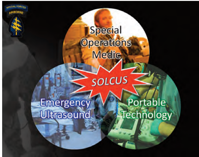
Figure 1: Venn diagram showing the relationship between emergency ultrasound, portable ultrasound technology and the SOF medic to create the Special Operator Level Clinical Ultrasound concept.

providers receive limited training in plain radiography, portable versions of these machines are neither readily available nor are they practical for the modern SOF battlefield. 4 Our extraordinarily talented medics possess the aptitude to learn and apply this skill and combining portable technology with the imaging ability for EUS, logically fills this deficiency.