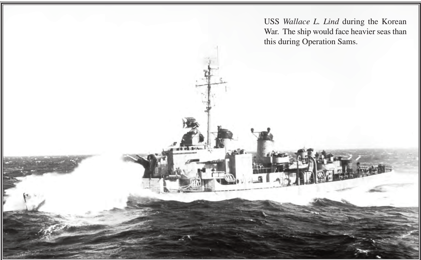
USS Wallace L. Lind during the Korean War. The ship would face heavier seas than this during Operation Sams.