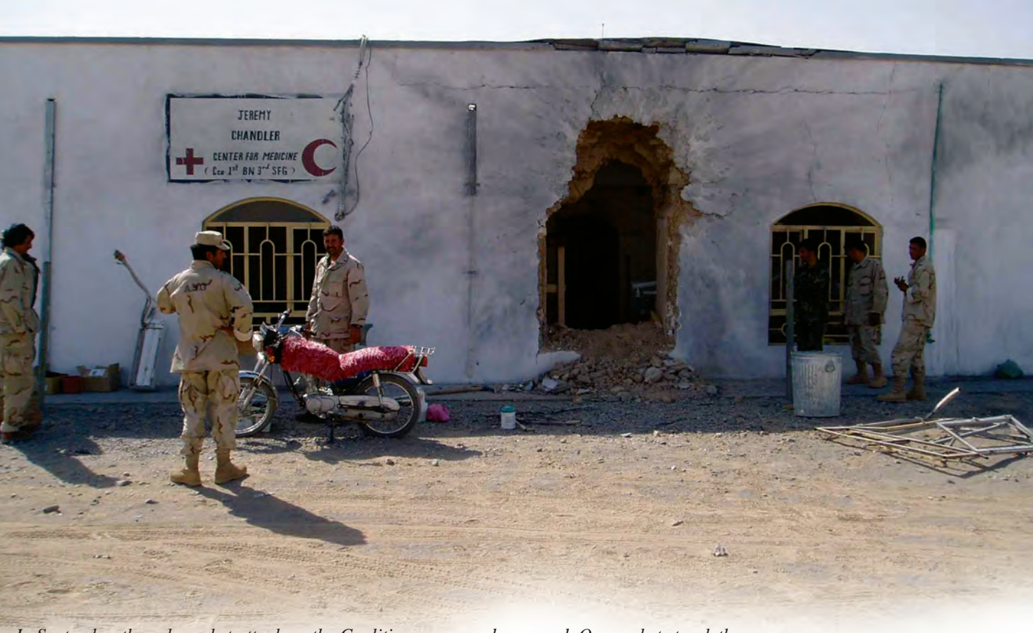
In September the sole rocket attack on the Coalition compound occurred. One rocket struck the hospital. The attack occurred on a Friday and the damage was repaired by the following Tuesday.

split, and stuck in his skull," said CPT Dunton. "When they brought the corpsman in, we were looking at what we call a 'circle in the drain' patient. He was literally 'spiraling down' and going fast. With him and the others, we were in a true mass casualty situation. Everyone worked all out and we had everyone stabilized pretty well inside of five hours. Except for the corpsmen, they were all evacuated in 18 hours (the corpsmen was evacuated after 36 hours.) That one event justified all the training and preparation."<sup>38</sup> Not only did the SORT save and preserve lives of those injured on the battlefield; it reduced the administrative load on the ARSOF Team medics.