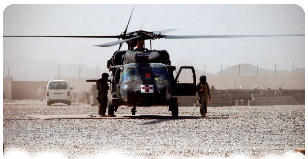
The UH-60 Black Hawk MEDEVAC helicopter preparing to take off on the pad on the PRT compound. Two black Hawks from Task Force-101 were stationed at Farah. One of the SORT medics rode on each bird on every flight.