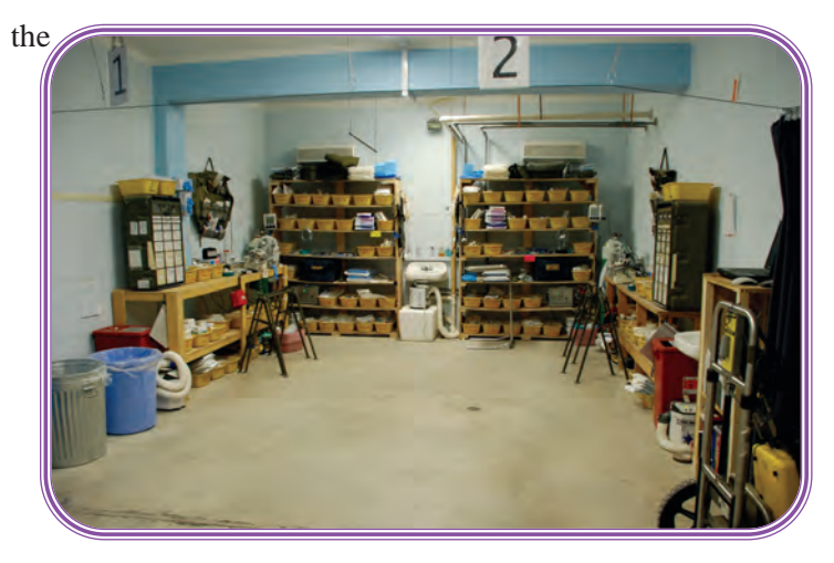
The SORT trauma ward. Patients were brought here initially for resuscitation and stabilization. The SORT could run up to four trauma beds simultaneously in this ward.