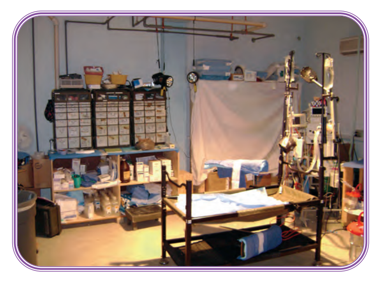
The operating room. A U.S. Army Reserve surgical team from Task Force Med provided the emergency surgical capability that the SORT did not have.