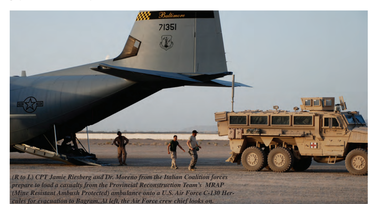
Journal of Special Operations Medicine Volume 9, Edition 2 / Spring 09