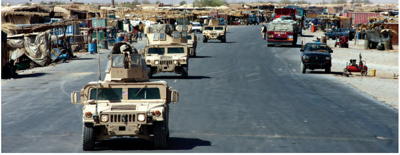
Marines on patrol in a village in Farah Province. The SORT provided medical coverage to the Marine Special Operations teams after their corpsmen were wounded in the 26 June ambush.

"It all came together on 26 June. The first Marine we saw walked in with a bullet literally sticking out of his head. A round had hit his NVG [night vision goggles] helmet bracket,